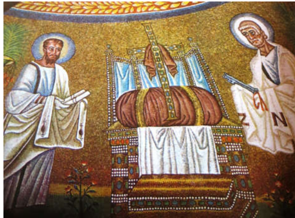
Photo of a mosaic from the dome of the Arlan Baptistry of Ravenna of an empty throne awaiting God: https://arsartisticadventureofmankind.com/tag/christ-in-majesty/